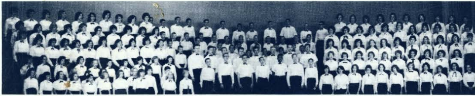
The combined Concert and Junior Chorus blended together beautifully.

May 12, 1964 Concert The Inlander (no date)