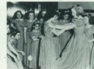
FUN BACKSTAGE between parties as these members of the Children's Chorus demonstrate that their talents are not entirely vocal.