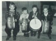
GIFT DRUMS FROM SANTA CLAUS and the sight of the photographer quieted these happy youngsters—for the time being.