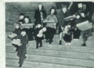
THE END OF A PERFECT PARTY for these gift-laden children. With a final look at the photographer they start happily towards home.