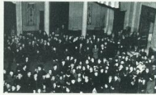
A THRONG OF EARLY ARRIVALS jammed Memorial Hall lobby just before the doors were opened.