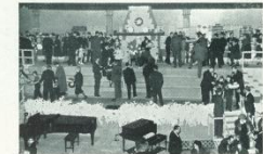
IT'S THE BIG MOMENT as Santa and his assistants distribute toys to wide-eyed children.