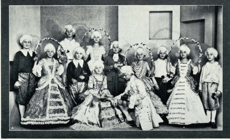
A PART OF THE CHOIR IN "BASTIEN AND BASTIENNE"