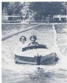
Down Motor Boat Lane