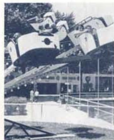
Hold tight! We're going up and over