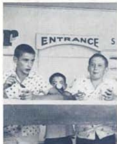
M-m-m . . . Ice cream, pop'n everything