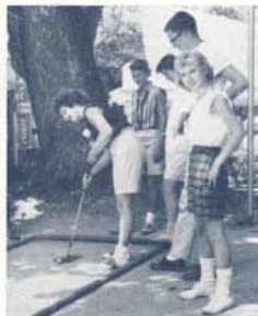
Just as serious as a putt in the PGA