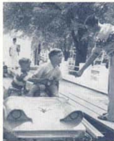
Tickets on this Turnpike?