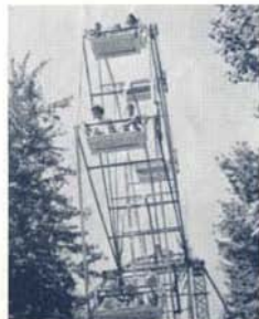
They almost touched the sky!