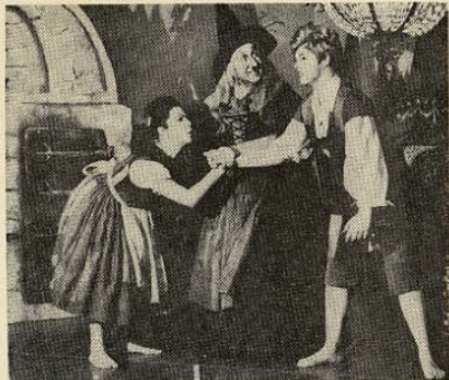
Daytonian as Gretel in Scene From Humperdinck Opera Given at White House