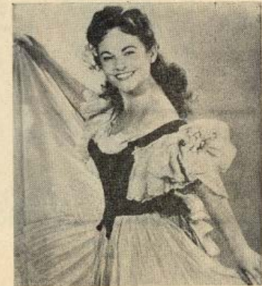
Beauteous Prima Donna Typical of New Opera Image

Lyndon Johnson gave for under-privileged children.