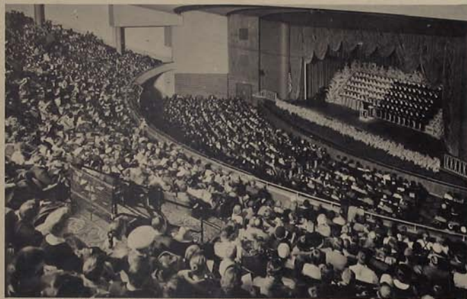
Inland Children's Chorus Sings Christmas Concert to capacity audience.