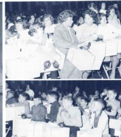
There were movies, popcorn balls, ice cream and presents for the boys and girls of the Chorus at their Christmas party.