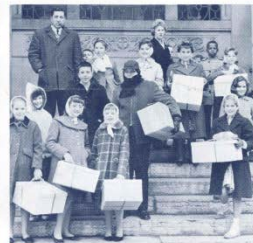
The annual Chorus Christmas party is over. Boys and girls leave Loretto with their gifts.