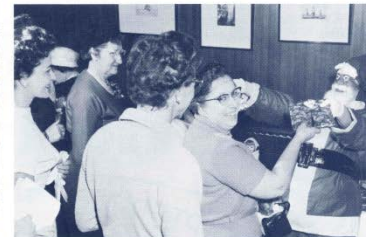
Hi-Ho!—Santa Claus was on hand to greet employees attending the Girls' Club party and to aid in the distribution of gifts. The party was held at the Van Cleave Hotel.