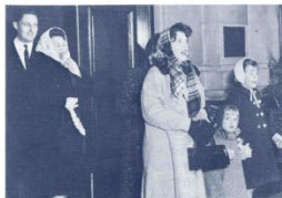
B-r-r—It's cold outside and the group pictured to the left is glad to get inside Memorial Hall. Below, people came in a hurry once the blackout was over and electrical power was restored.