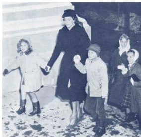
Conditions made little difference to these eager youngsters and mother. They were dressed for the weather.