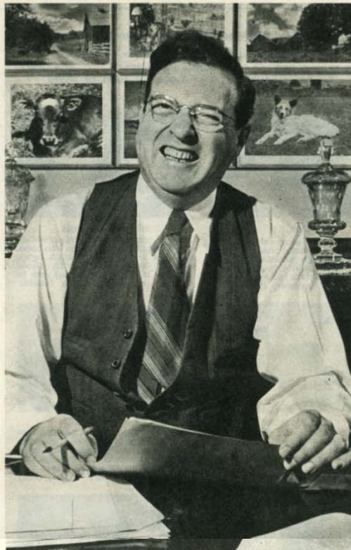
The acme of refinement and good taste in radio comes from Hell's Kitchen.

INKO-GRAPH 2 Inkograph Co., Inc., 200 Hudson St., N.Y.C. 13