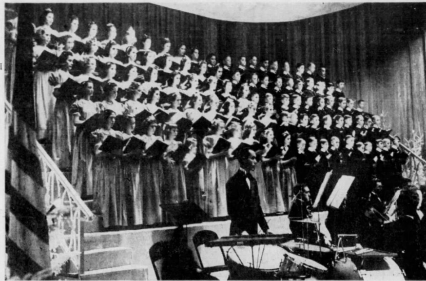
The Inland chorus concert group of 100 children is shown above at dress rehearsal in the Masonic Temple. In the foreground a part of the Philharmonic orchestra may be seen.