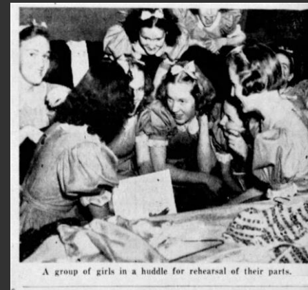
A group of girls in a huddle for rehearsal of their parts.