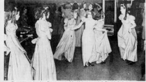
The youngsters from, Inc. Here you see some of the girls having memorably floundered in the dressing rooms.