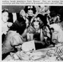
A group of girls in a hallway for rehearsal of their parts.