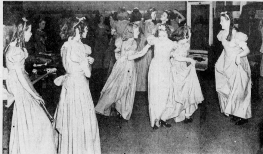
The youngsters can dance, too. Here you see some of the girls turning momentarily flippant in the dressing rooms.