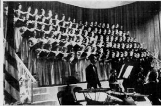
The latest choral concert group of 100 children is shown here at their rehearsal in the Masonic Temple. In the foreground a part of the Philadelphia orchestra may be seen.