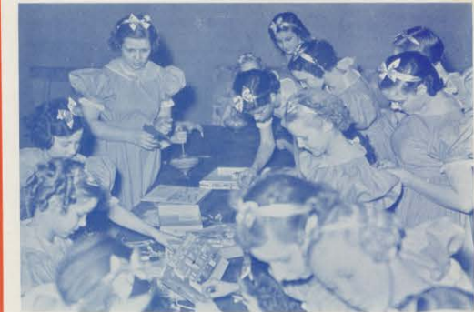
"It Wasn't All Work and No Play For Our Children"