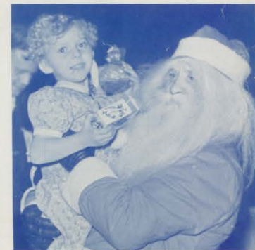
"No Comments Needed"