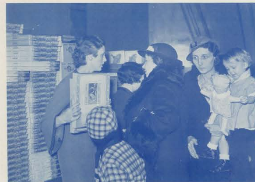
"Each Child Received a Toy, a Ball of Pop Corn and a Box of Candy"