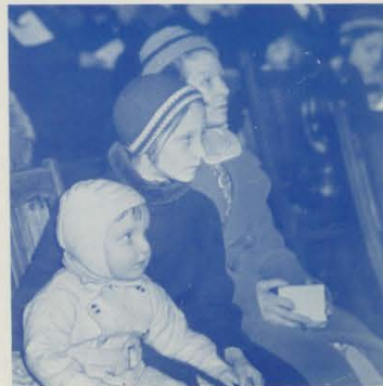
"Santa is About Due"

Our Management greatly appreciates the splendid work which was done by each person who assisted with the party; they are grateful to the parents of the children who are members of the Chorus, for their fine spirit of co-operation. The party was a real success.