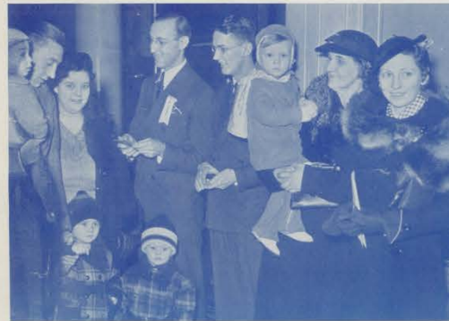
"At the Door"