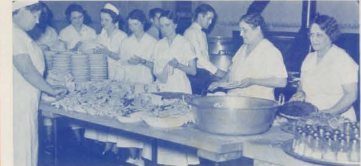
"The Children and Our Hard Working Party Organization Were Well Fed . . . Preparing the Turkey Dinner"