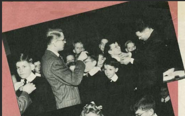
Personnel executives from Inland are drafted into pre-concert service by the "men of the Chorus."