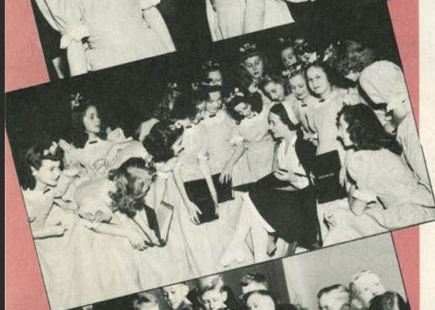
Nurse from Inland's Medical Department is on hand during all concerts and rehearsals, to meet any emergency that may arise.