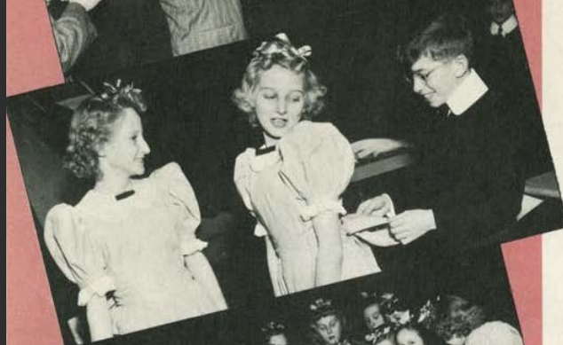
Bows and beaux are fit to be tied in backstage scenes such as this. There are many sister and brother groups in the Chorus.