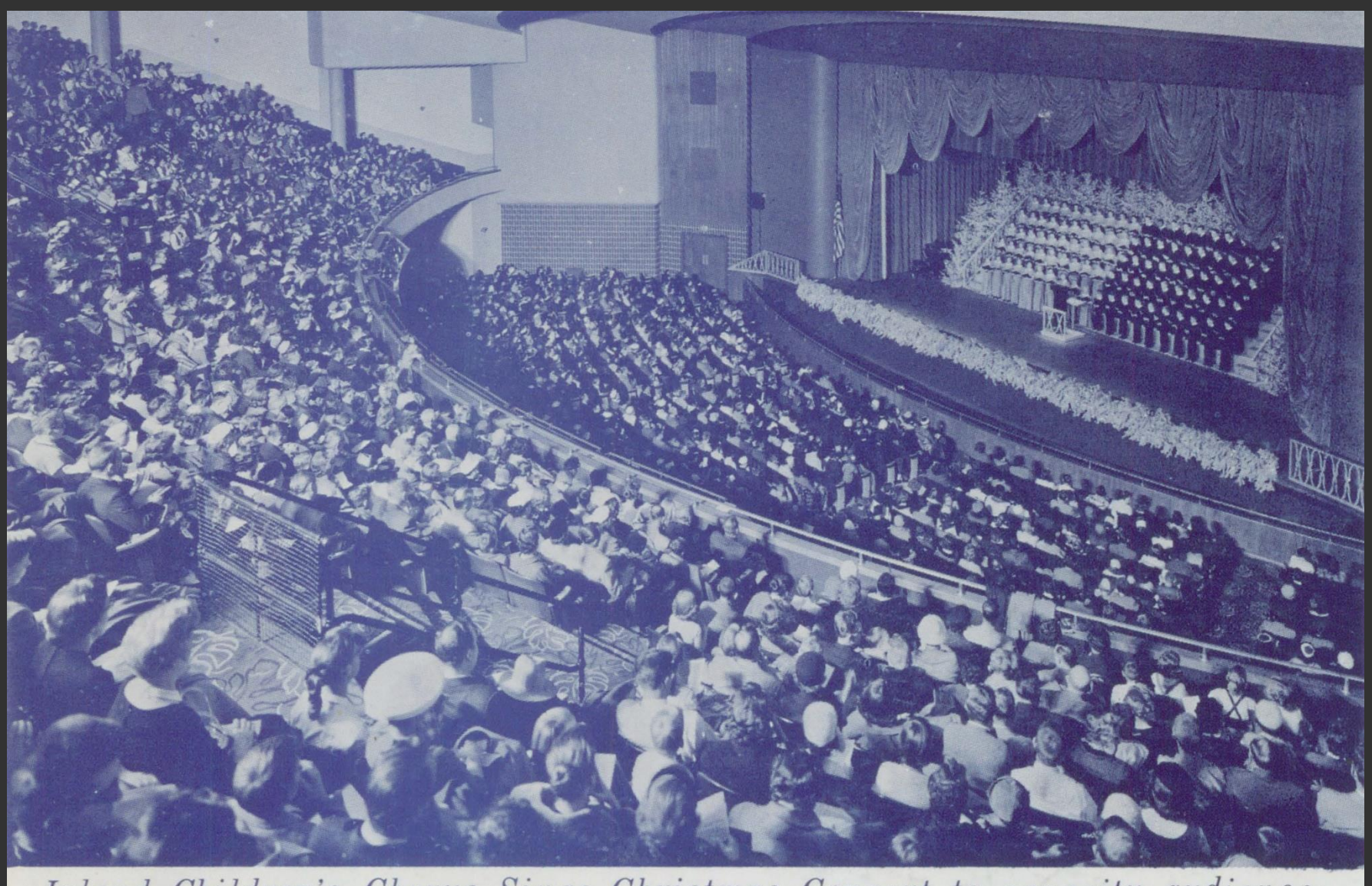
Inland Children's Chorus Sings Christmas Concert to capacity audience.