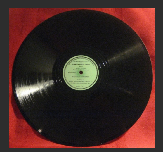
Record 1: Side A = Part 1