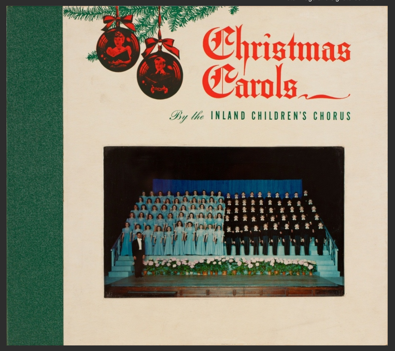
Contains three 12-inch 78 rpm records