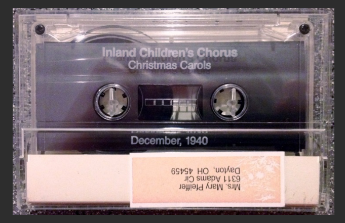
Back cover of cassette case