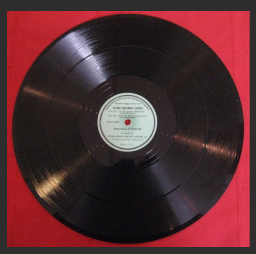
Record 1: Side B = Part 2(a) and 2(b)