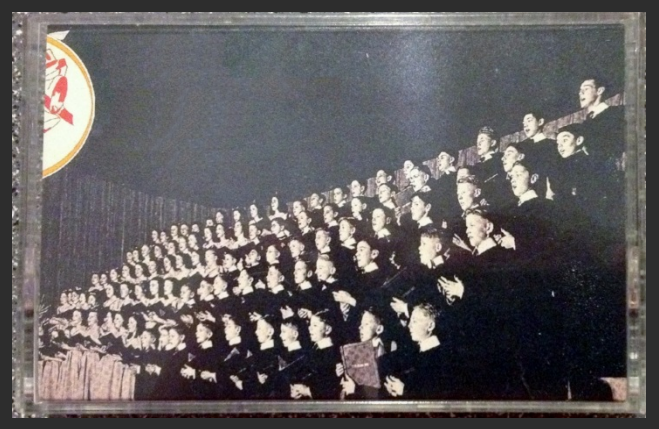
Front cover of cassette case