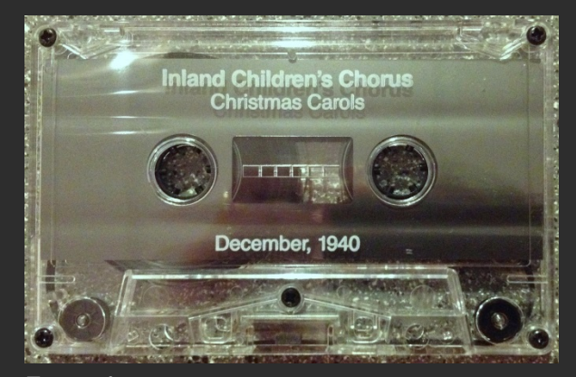
Front of cassette tape