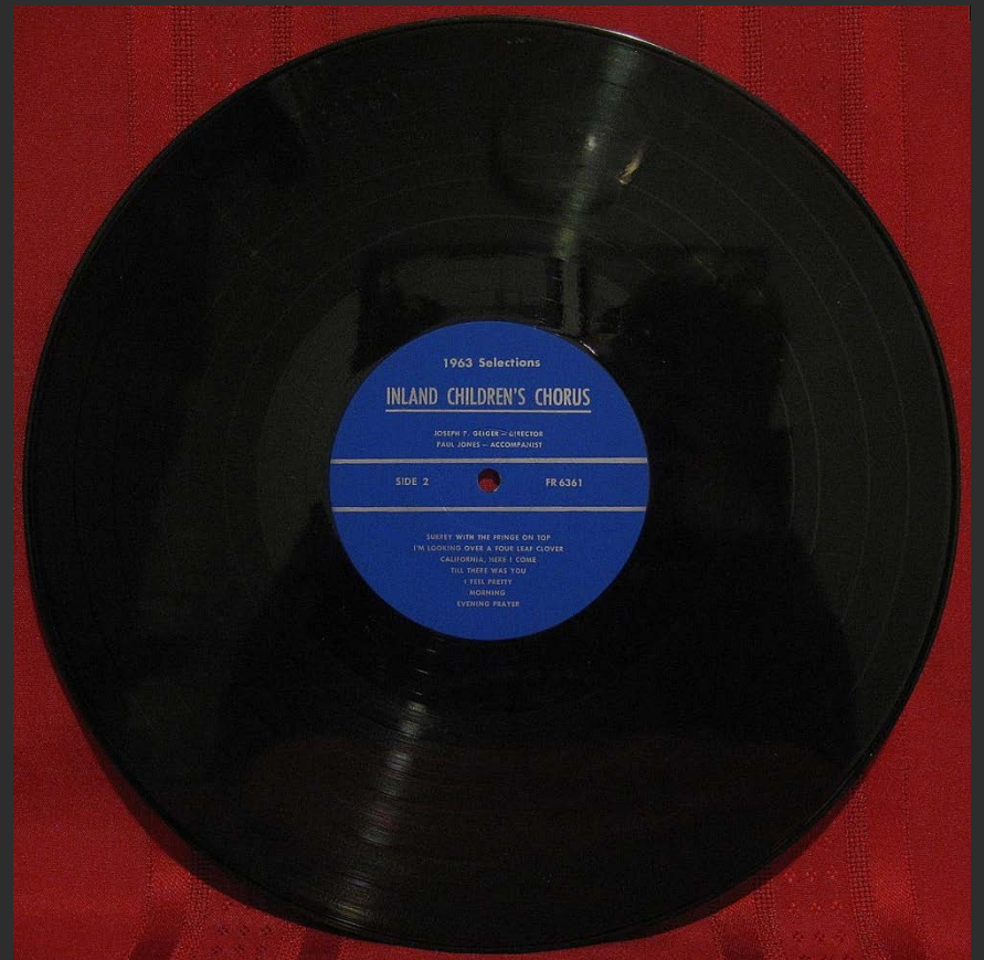
Side 2: 1963 Blue Label 12-inch Record