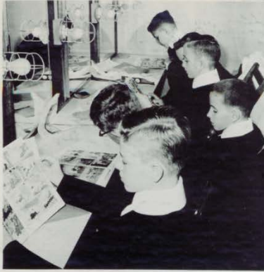
For the boys, there's time to relax before curtain call...