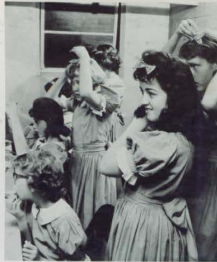
But there's ever so much to do when you are a girl!