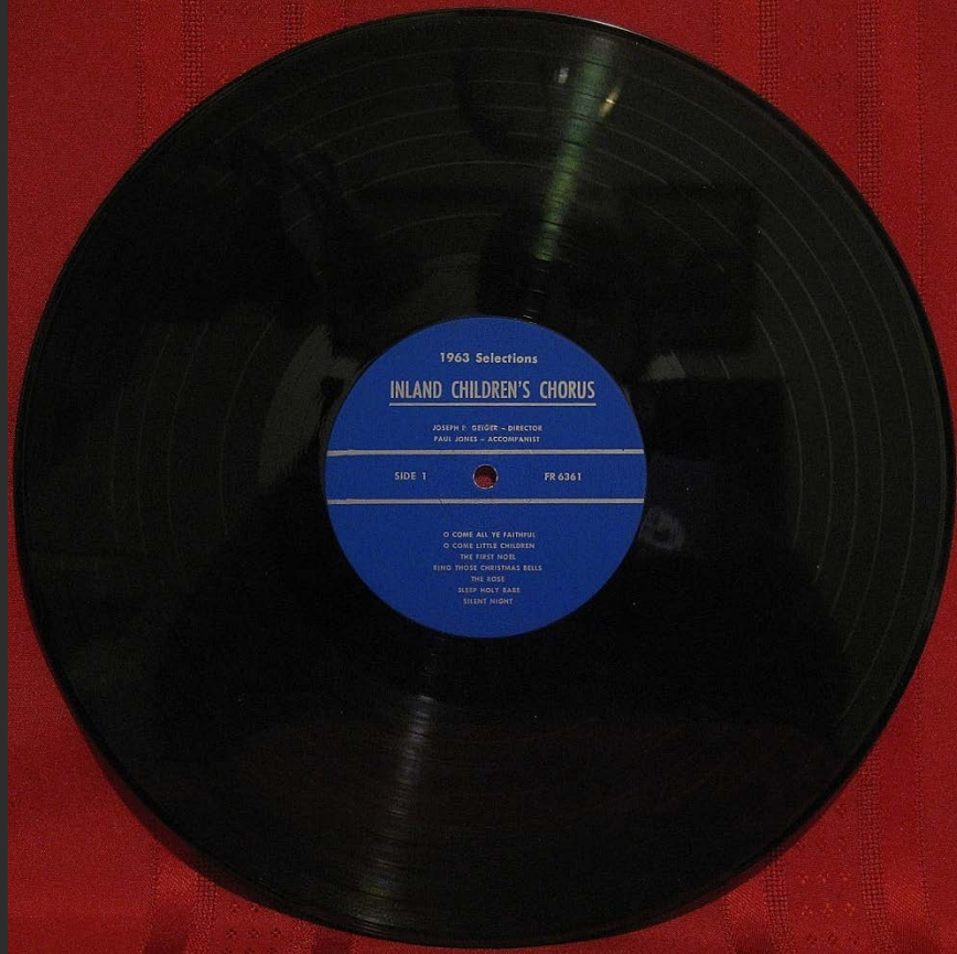
Side 1: 1963 Blue Label 12-inch Record