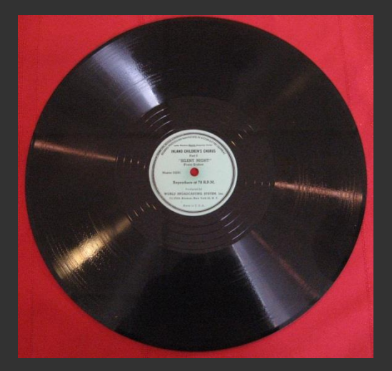
Record 3: Side A = Part 5