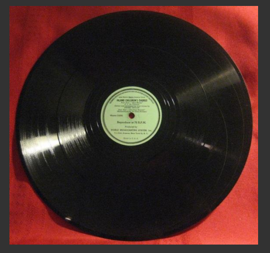
Record 3: Side B = Part 6(a) and 6(b)