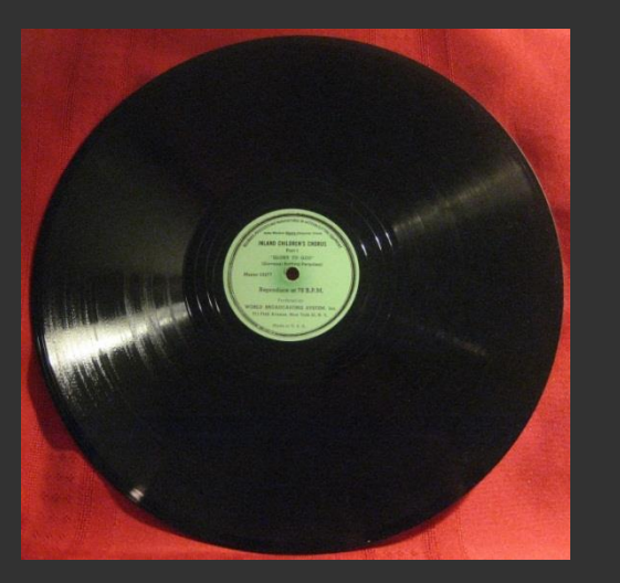
Record 1: Side A = Part 1