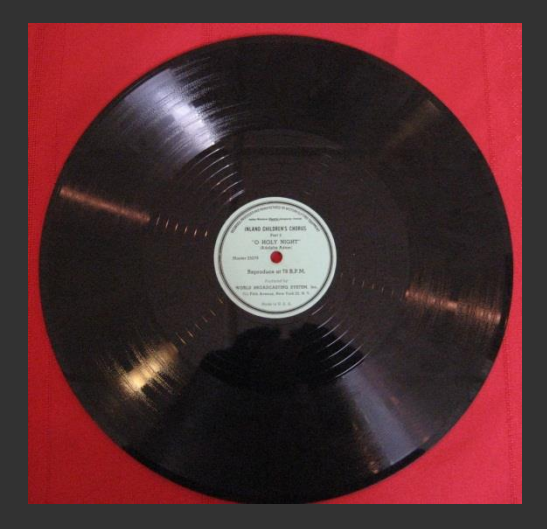
Record 2: Side A = Part 3