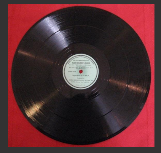
Record 1: Side B = Part 2(a) and 2(b)