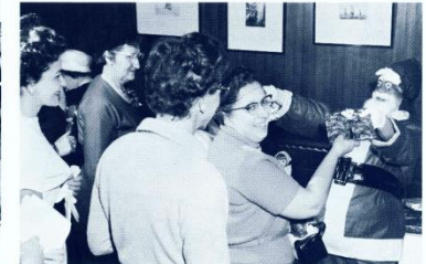
Hi-Hal—Santa Claus was on hand to greet employes attending the Girls' Club party and to aid in the distribution of gifts. The party was held at the Van Cleve Hotel.