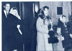
B-r-r—It's cold outside and the group pictured to the left is glad to get inside Memorial Hall. Below, people came in a hurry once the blackout was over and electrical power was restored.