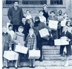
The annual Chorus Christmas party is over. Boys and girls leave Loretto with their gifts.