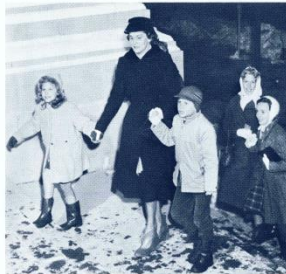
Conditions made little difference to these eager youngsters and mother. They were dressed for the weather.