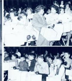
There were movies, popcorn balls, ice cream and presents for the boys and girls of the Chorus at their Christmas party.