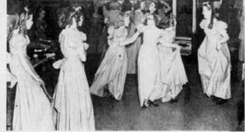
The youngsters can dance, too. Here too are some of the girls learning moderately difficult steps in the dressing rooms.