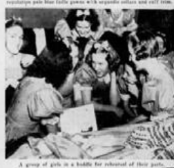
A group of girls in a hall for rehearsal of their songs.