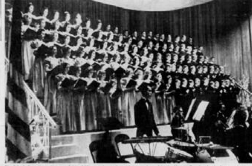
The mixed choral group of 100 children in show dress will sing chorally in the Hanna Temple. In the foreground a part of the Philadelphia orchestra may be seen.