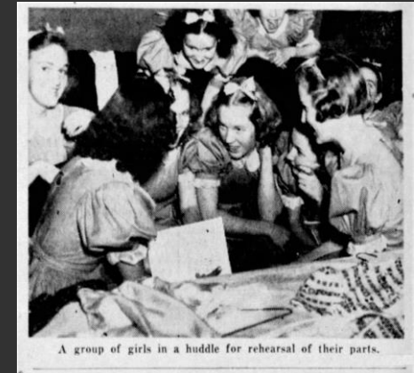
A group of girls in a huddle for rehearsal of their parts.