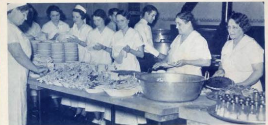
"The Children and Our Hard Working Party Organization Were Well Fed . . . Preparing the Turkey Dinner"

"For my part, I pledge you the unceasing efforts of every officer and supervisor of this Company to make next year again the best year for all of us."