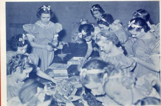
"It Wasn't All Work and No Play For Our Children"