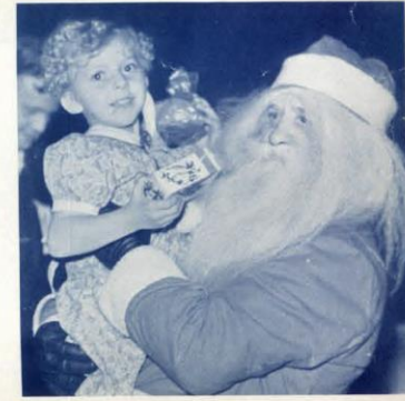
"No Comments Needed"