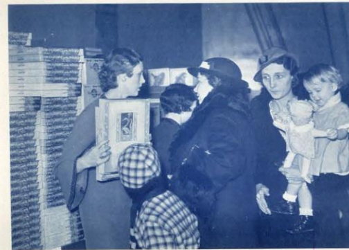
"Each Child Received a Toy, a Ball of Pop Corn and a Box of Candy"