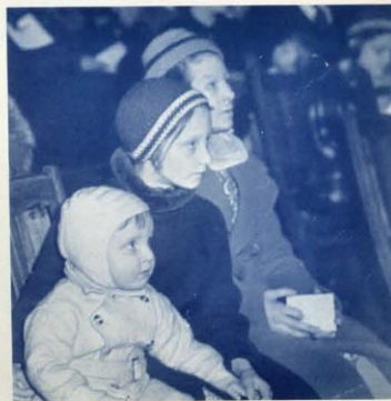
"Santa is About Due"