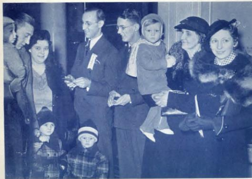
"At the Door"